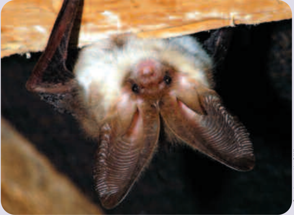
Brown long-eared bat

Answers to the most frequently asked questions about sharing your home with bats, advice on looking after your lodgers, a guide to identifying the species most likely to be living in your house, guidelines on caring for grounded bats and useful contacts for further information.