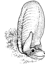
Grey long-eared Plecotus austriacus

There are two species of long eared bat in the UK, brown long-eared and grey long-eared. Brown long-eareds are much more common; the range of the grey long-eared is confined to southern England.