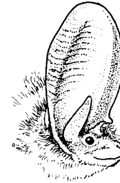
Brown long-eared Plecotus auritus